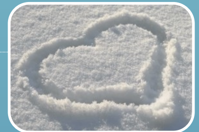
Living Extreme means...