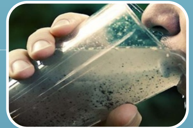
Living Extreme means...

We have Jesus, and we have control over ourselves, we need to put both things into action and live a life that seeks the pure things. If you were a cup of water would you drink you? Or would you start thinking about all the things in your life that you would rather not want to drink? See you have to believe that God's way is the best way and when He says that we should seek to be pure, well then we need to seek it out and depend on Him to show us how we can live a life running after purity in a world that seeks to make us contaminated.