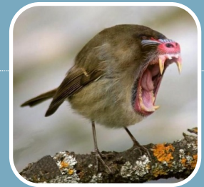
Teeth! It's Got Teeth!

It has been a process, but I find my mind is clearer and more at rest. My mouth used to lead me and often times get me into trouble, but now my brain is leading me and the mouth follows. I say less, and I regret less. I make my words count, and have importance! Give it a try, think before you speak!