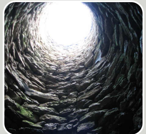
Joseph in the well"looking up from the bottom of the well"